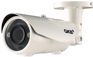
1080P HD IR Waterproof Bullet Network Camera